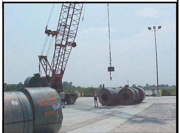
Logistic Services, Inc. employees unloading the first barge of coil steel bound for the Wheatland Tube Company in the Little Rock Port Industrial Park.